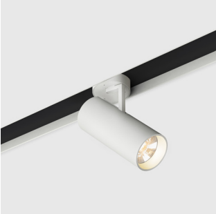
holon 80 twin in-cana