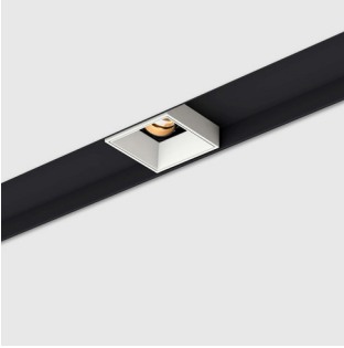
prologe 80 twin in-cana