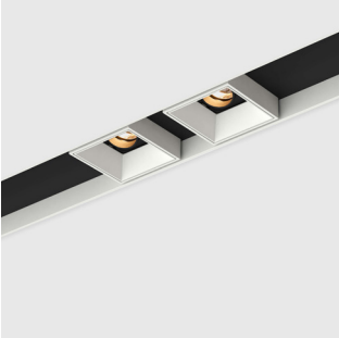
holon 80 directional in-cana