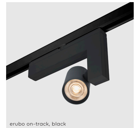
erubo on-track, black