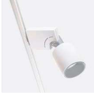
White Xharon on-Track T4.5 CMH