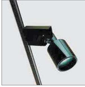
Black Xharon on-Track T4 bi-pin with diffusing lens

Xharon on-Track offers the opportunity to modify light settings quick and easy. Due to its extensive range of possible adjustments, this luminaire is suitable in spaces that need flexibility, such as galleries and commercial spaces. Xharon on-Track needs to be mounted on 2-circuit Eutrac tracks.